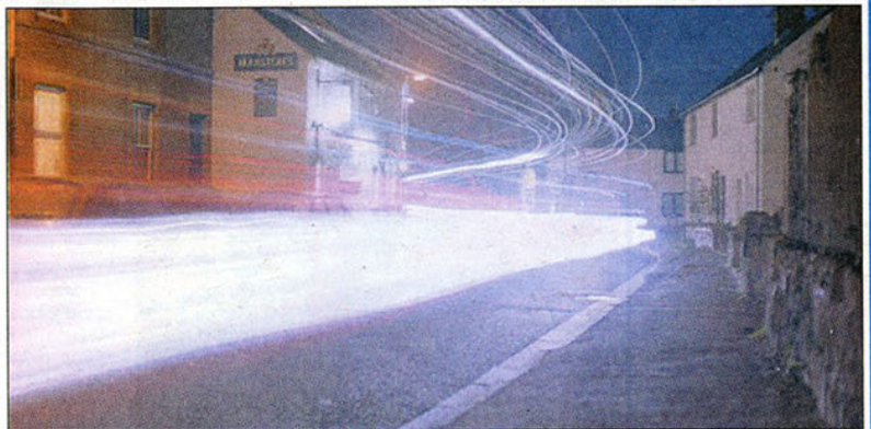
Photographs show the dramatic effects of diverting traffic through a quiet village

"I just like taking photographs, any excuse really."