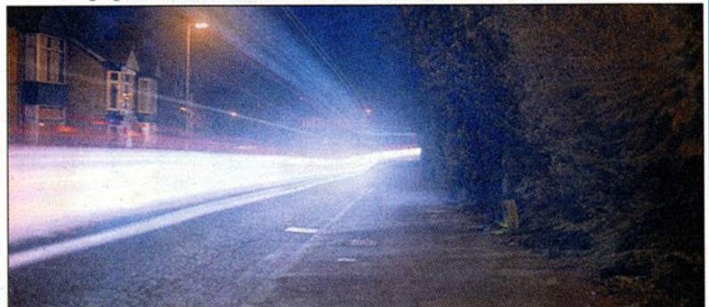
The university student's photographs show the large volume of traffic using the road